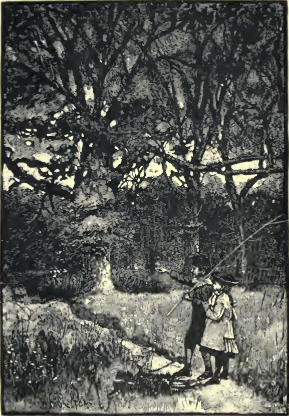
"ACROSS THE HOMESTEAD TO THE ROOKERY ELMS, WHOSE TALL OLD TRUNKS HAD EACH A GRASSY MOUND.